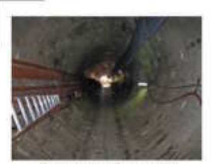
Durban Harbour Tunniel project