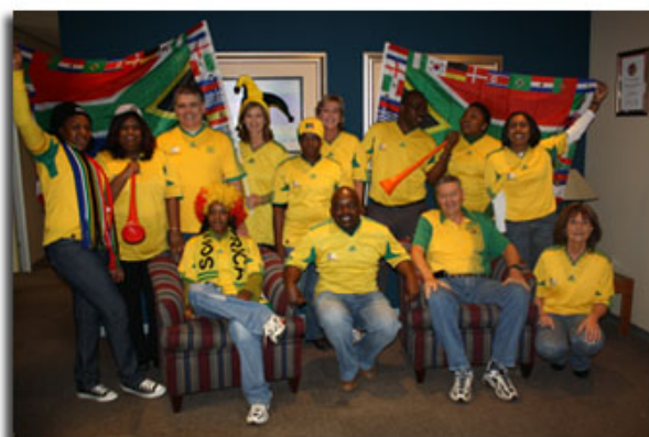
CESA staff getting into the spirit of the World Cup

The Challenge that the World Cup has left us with is to ensure that we continue to embody the spirit of all that is good surrounding what has turned out to be the most successful World Cup ever. We need to transfer this success into our workplace going forward, to ensure that as a Nation we move closer towards creating a normalised society built on common goals founded on the spirit and relationships created during this highly successful event.