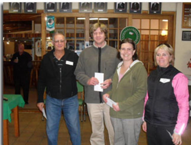
2nd – CESA Allstars (a mixed team)