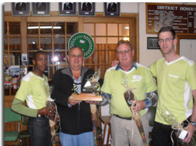
1st – Aurecon Tsitsikamma