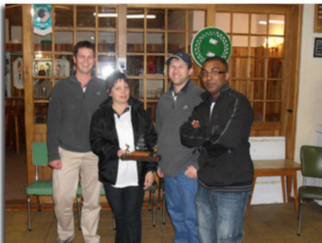
The Plate Winner was: 1st – KV3 Engineers Team 1