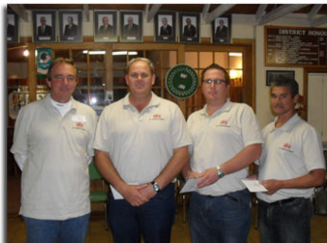
3rd – De Villiers and Moore Consulting Engineers