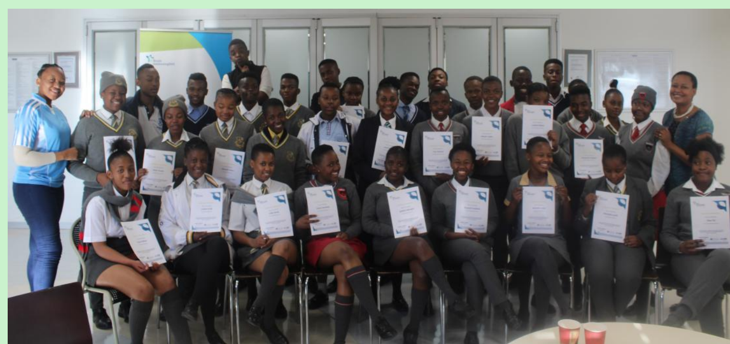
Job Shadow Day—Woodmead Office, Johannesburg —17 th July 2019

Students were taught about data analytics, it's role in our engineering practices and shown different pieces of technology, such as the Holo-lens and a survey drone, that we use in our digital ways of working.