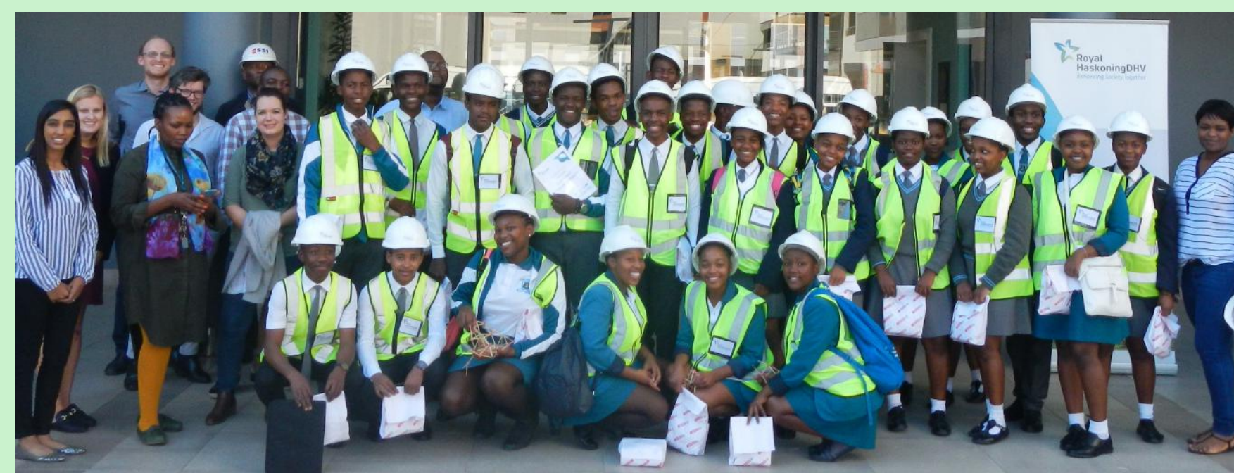
Job Shadow Day—Umhlanga Office, Durban —23 rd July 2019