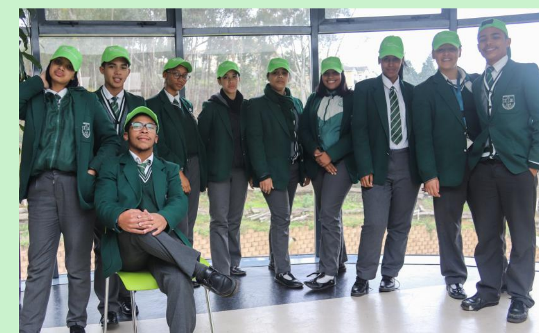
Job Shadow Day—Platterkloof Office, Cape Town — 25 th July 2019