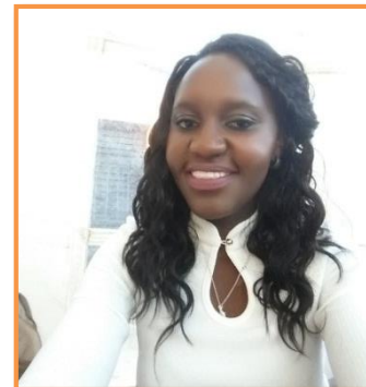
By: Yankho Banda (MPA Consulting)

To contribute articles for this section please contact the editor on: kmmekwa@phb.co.za