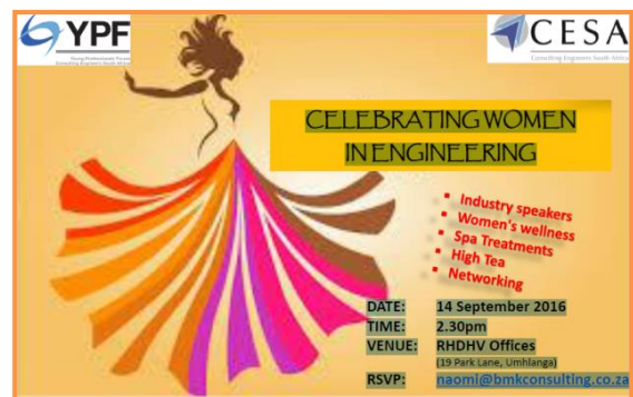
Celebrating Women in Engineering poster