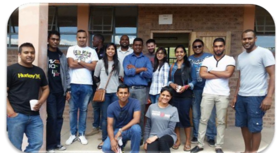
KZN Branch Committee