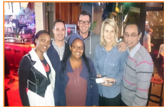
Quiz Night at Firemans Arms