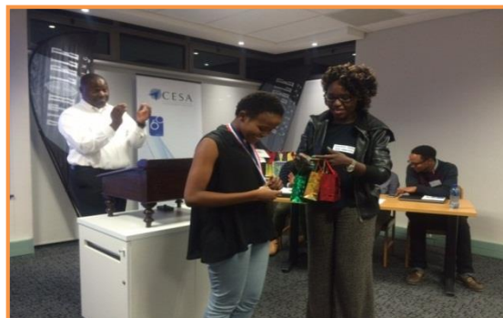
The Zitholele Great Debate runners up receiving their prizes