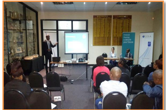
Financial Management and Networking Seminar