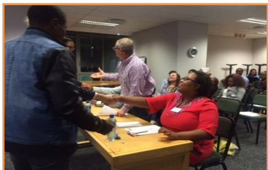
Great Debate Judges