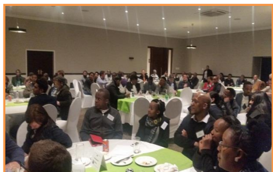
Quiz Night Attendees