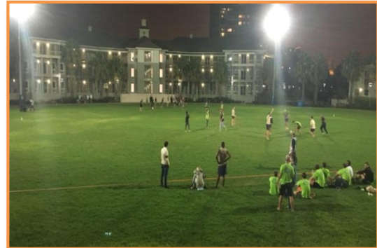
Touch Rugby Event at Central Park