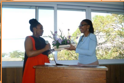
Women in Engineering Breakfast