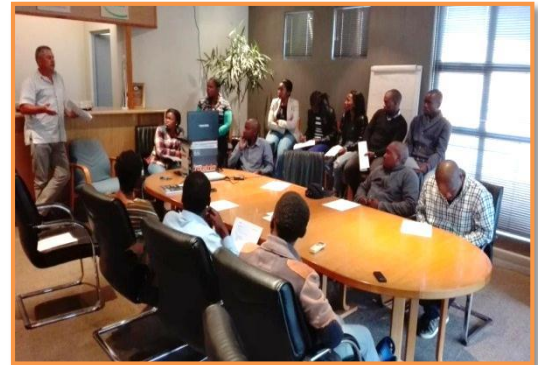
Strategic planning meeting branch meeting

The CESA YPF BK branch was proud to support and celebrate Women In Engineering. The event was prepared by Women in Engineering for Women in Engineering. The Seminar was aimed at empowering and uplifting career-orientated women in the world of work. It was also intended to encourage emotional intelligence and resilience to challenges and hardships faced by women in the industry whilst still maintaining healthy working relationships.