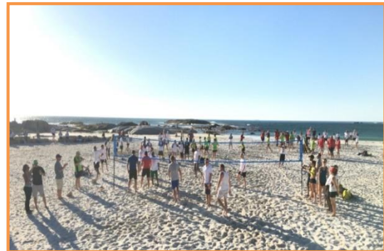
Volleyball Tournament at Camps Bay