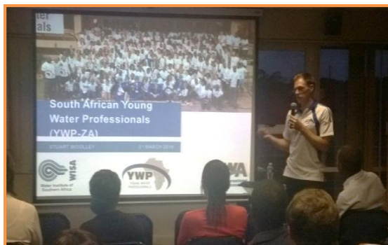
Representative from YWP-ZA addressing attendees at the Meet and Greet

This is fast becoming an annual event and a crowd favourite. Hosted by UWP Bryanston at the Prestigious Bryanston Country Club for the second year, the event is intended for YP's to relax, laugh, network and unwind whilst testing their general knowledge in a stress-free atmosphere. This year saw the participation of not only CESA member firms YPs but also the participation of university students from the SAICE Wits Student Chapter as well as YP from the SAICE Johannesburg Branch.