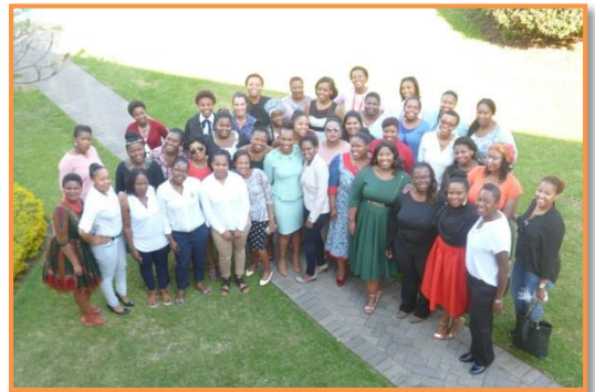
Women in Engineering Breakfast