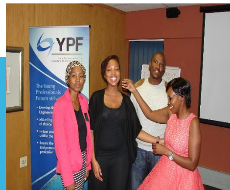
Newly Elected Committee 2015