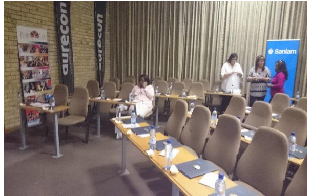
CUT's 94 Seater Auditorium