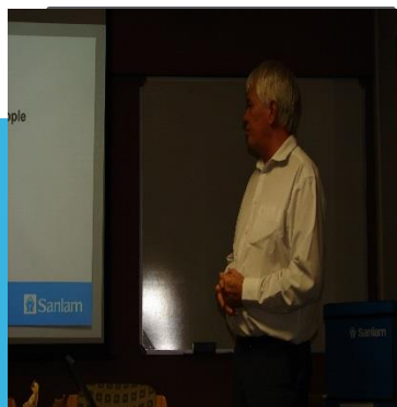
Main Speaker for the evening