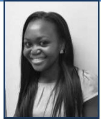
By: Lelethu Thiso (Iliso Consulting)

To contribute articles for this section please contact the editor on: kmmekwa@phb.co.za