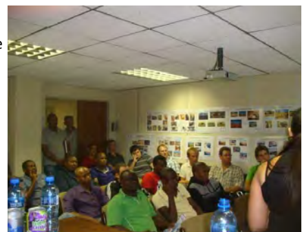
Right: YP's in attendance