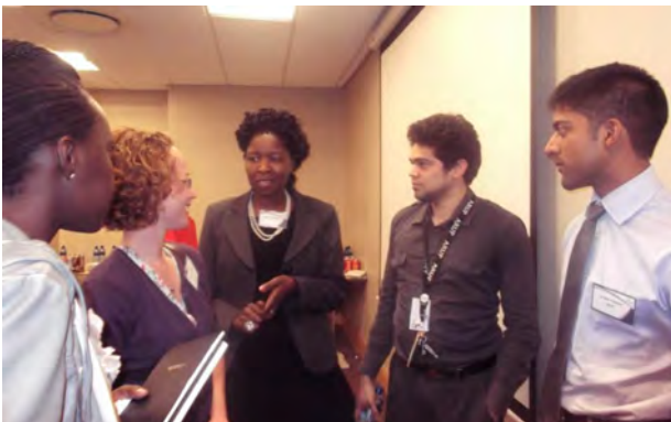
Above and Right: YP's in action