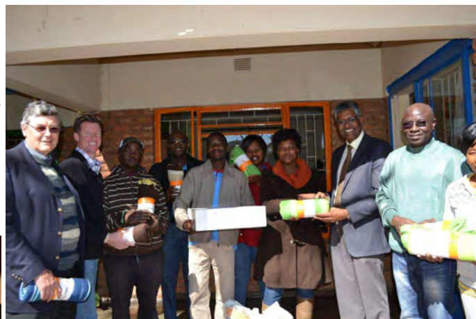
Right: CESA delegation and YPF handing over blankets at the Children's Home