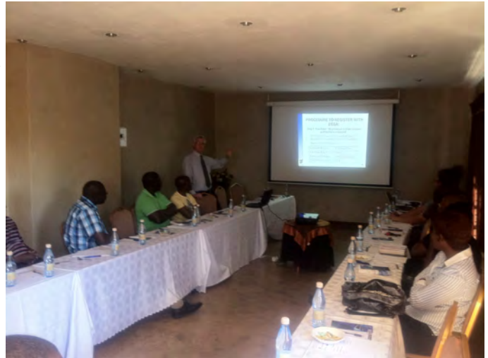
Right: YP’s in attendance at the Road to Registration Workshop

YPF and branch committee at the CESA Conference held in Durban at the Durban International Conventional Centre from the 4 th – 6 th November 2012 as well as the CESA Conference Golf day on the 4 th November 2012.