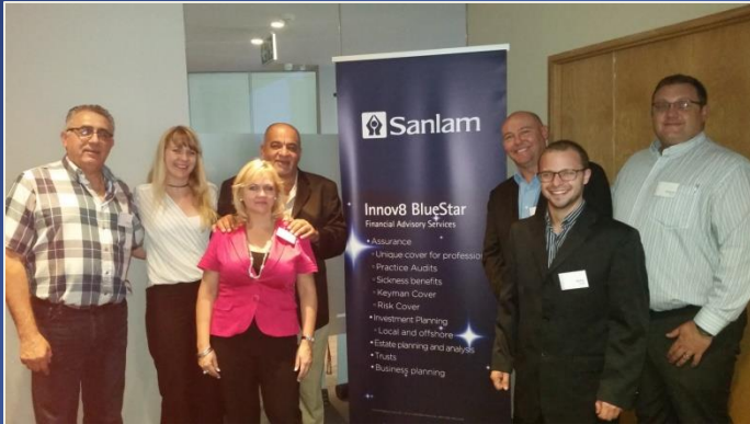
The Sanlam Innov8 team