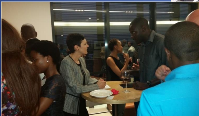
YP's mingling with the Innov8 team.