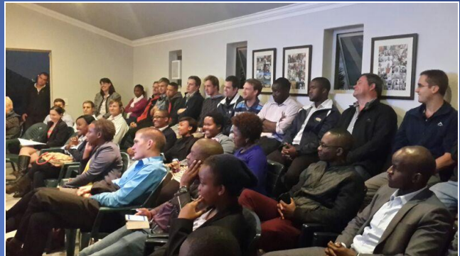
The showcase attendees