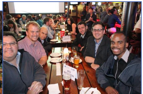
Quiz Night participants

The branch kept up with the action packed pace of the first half by hosting the following activities for the remainder of 2018: