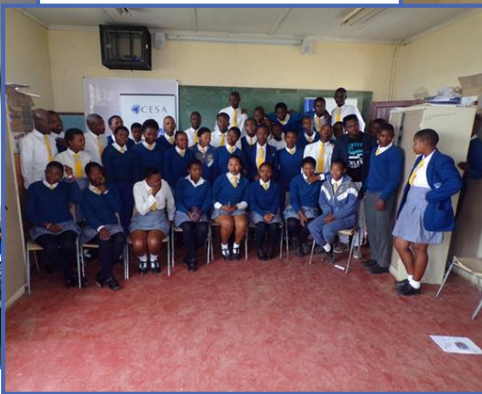
Bazindlovu Senior Secondary School visit