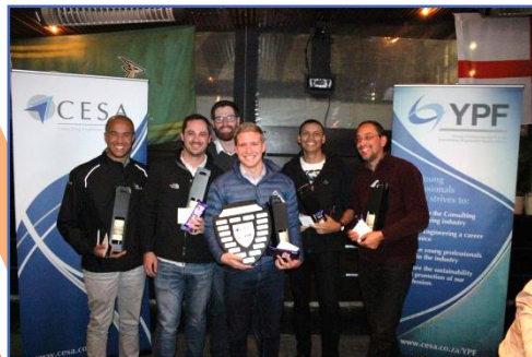
Winners: Bvi Consulting

Arguably one of our most popular events, the Quiz Night was eagerly anticipated which was evident by the entries received long before the 6 th June 2018, which was the day chosen for entrants to have fun and share some laughter whilst testing their knowledge on various topics ranging from sport to music and general knowledge. As expected, the event was well attended and for the first time, various universities were invited to send a team to participate. The Quiz masters (winners) for the night were Bvi Consulting.