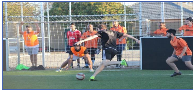
Nail-biting moment on the pitch during Soccer Tournament

In previous years, the 5-a-side soccer tournament was held around August/September however it was discovered that companies did not enter as this was during the soccer league season. Therefore, the branch decided to schedule this year's soccer tournament for 13 th April 2018, during the pre-season of the outdoor soccer league. All in all the event was successful with a total of 12 teams participating with Kantey & TEMPLER emerging the overall winner.