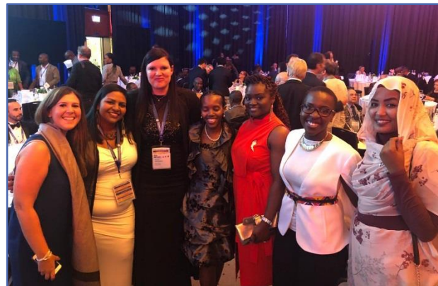
FIDIC Gala Dinner