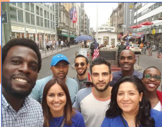
Sight seeing in Berlin

In-between all the sessions, a lot of networking was done, with delegates from a multitude of countries in attendance there was much to learn and share! The conference also arranged several sight-seeing activities and dinner functions for delegates to get a feel of Berlin over a few glasses of local beer – when in Berlin, right! These excursions and networking opportunities afforded us all the opportunity to engage with one another in a more relaxed environment and form personal and business relationships that will hopefully last well into the future. A huge thank you to ACSA and CESA for affording me the opportunity to learn and gain insight to the industry at a global level – the experience has been truly invaluable.