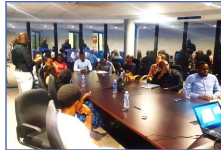
SOBA in full swing