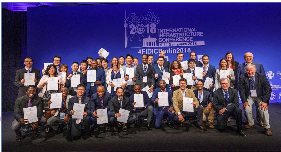
2018 FIDIC Young Professionals Management Training Programme Graduates

The day ended off with presentations given by 35 participants who attended the Young Professionals Management Training Programme. The programme consists of two components: an intensive 7-month virtual learning course followed by a week of in-person working sessions and attendance at the annual conference. To conclude the programme, the teams were given the task of collaborating and presenting an innovation they felt could strengthen the global network of consulting engineers. The solution they presented was an online global knowledge platform to unite the vast knowledge and experience of FIDIC members across the world. The innovation was well received by the audience with FIDIC's leadership promising to support the development of the idea further.