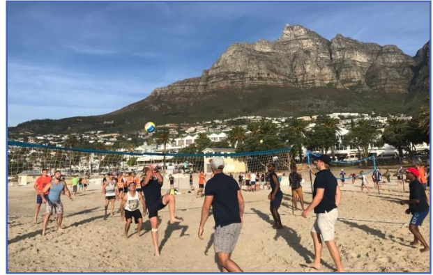
Beach Volleyball Participants doing their thing

With the sun setting after 20:00 in summer in Cape Town, what better way to enjoy the beautiful scenery than to play Beach Volleyball!!! This is what the branch decided to do on the 22 nd February 2018. Even though limited to 4 volleyball nets, a whopping 16 teams signed up to do battle on the sand. Competition between the teams was stiff (even though some seemed to have come to do battle with the sand) but like any tournament, there could only be one winner. The event was a huge success, thoroughly enjoyed by both the players and spectators and congratulations to KFD Wilkinson for being the overall winners.