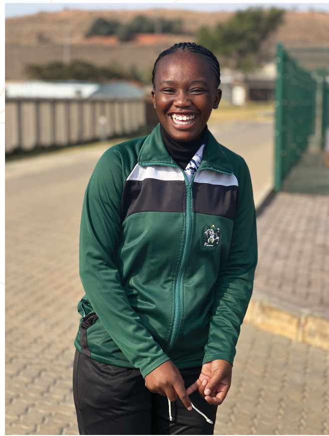
Site Visit at Driefontein WTW